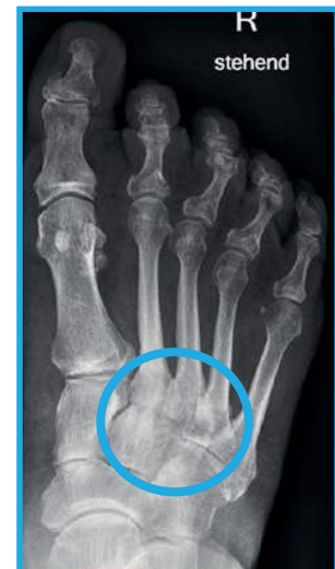
10 months postoperative